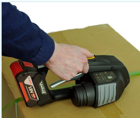
VH97A Zapstrapper with PET strapping