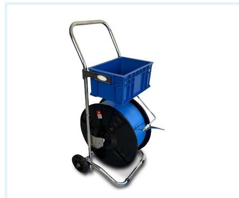
VH9E Strapping Dispenser with Venhart No. 2 PP Blue Hand Roll